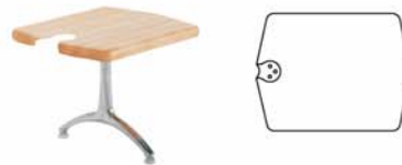
A600R Bench Seat 430mmHx600mmWx450mmD Seat: 430mmH Weight: 10kg