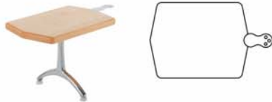
A600L Bench Seat 430mmHx600mmWx450mmD Seat: 430mmH Weight: 10kg