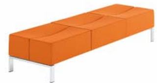
A843 Triple Bench Unit