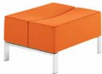
A841 Bench Unit