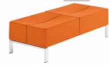
A842 Double Bench Unit