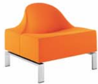
A840 Seat Unit