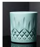
Crystal Stool H 460mm D 426mm