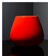
Cognac Stool H 460mm D 344/532mm