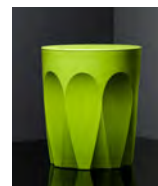
Latte Stool H 460mm D 338mm